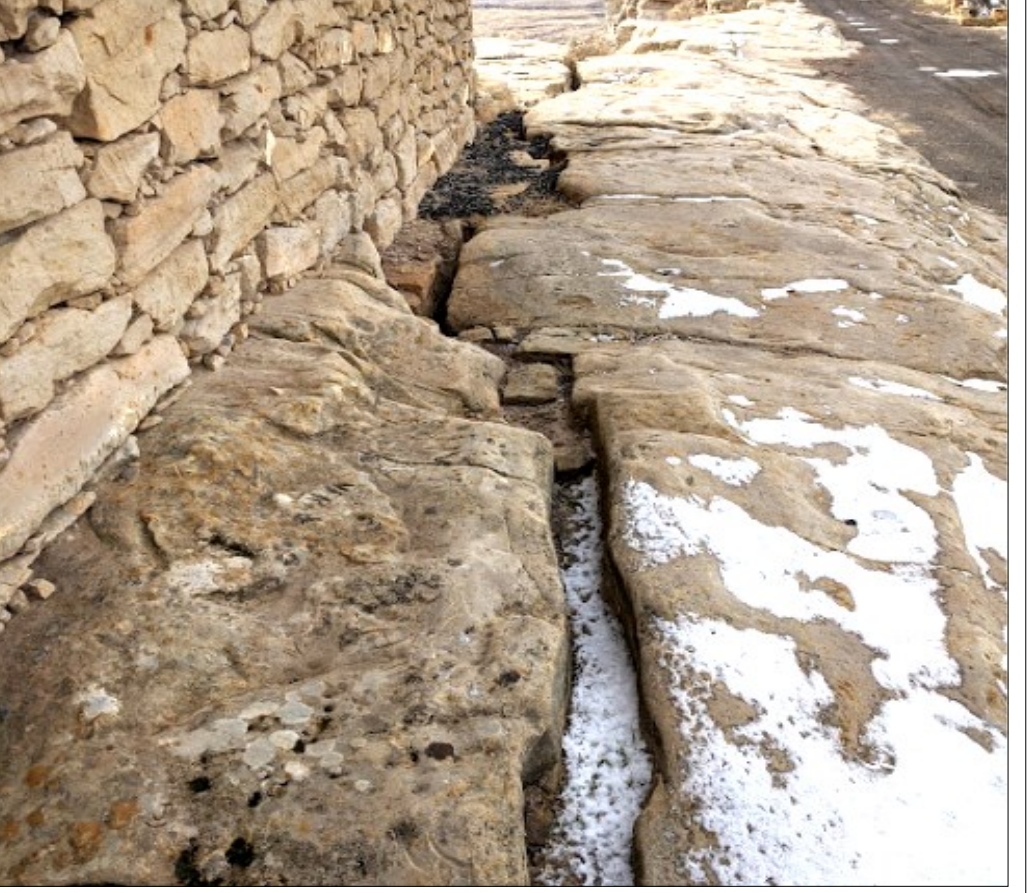
Sightings of more cracks on First Mesa have been reported. Everyone is reminded to be cautious and alert when attending ceremonies and events on the Mesa.

These and other plans of the Hopi Tribe fortunately, they are out of date, have exceeded time limits for review/renewal, and/or are not being adhered to. This adds to confusion, miscommunication, or noncommunication during a crisis event. It be pre-approved by FEMA before publica- cedure, or protocol. They were established of mesa plateaus. Specifically, areas of resitive review and reevaluation process is for.