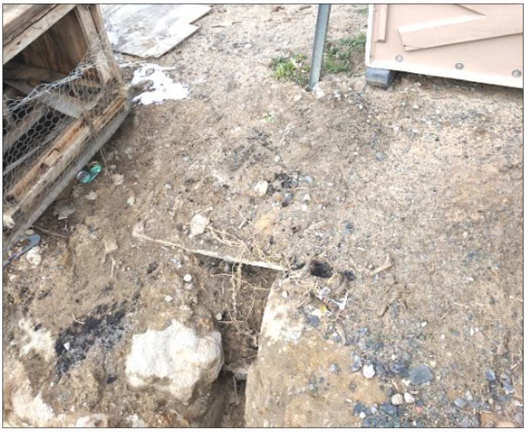
Several areas around the entire Mesa have been identified with small cracks and holes. Please remain alert and cautious when on the Mesa.