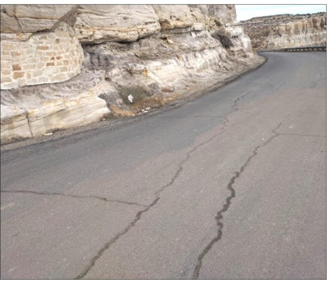
Road leading up to the Mesa. Sealant around retaining wall eroding with several new cracks in the road.