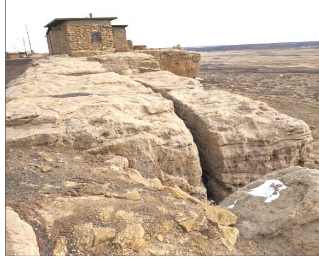
Going into Walpi Village near the dip