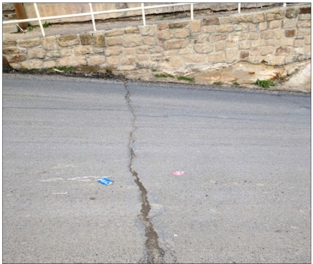
Coming on to the Mesa near the Tewa Road Kiva