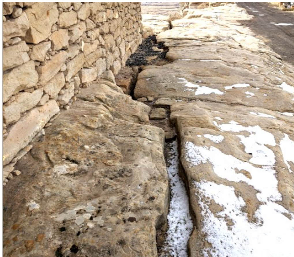
Sightings of more cracks on First Mesa have been reported. Everyone is reminded to be cautious and alert when attending ceremonies and events on the Mesa.

These and other plans of the Hopi Tribe are vital to our community's welfare. Unfortunately, they are out of date, have exceeded time limits for review/renewal, and/or are not being adhered to. This adds to confusion, miscommunication, or non-communication during a crisis event. It may also lead to circumventing policy, procedure, or protocol. They were established as being the most effectual, efficient, and ethical means to solutions at the time of their writing. If they are deemed to be inefficient, ineffectual, or unethical, that's what the review and reevaluation process is for.