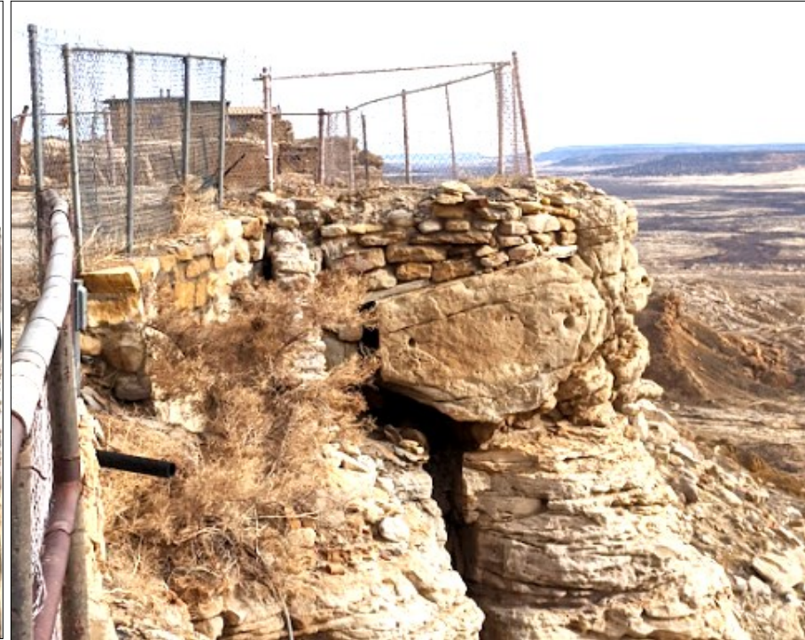
Several major cracks have been observed on First Mesa and Villagers are reminded to be vigilant and extremely careful when on the Mesa.