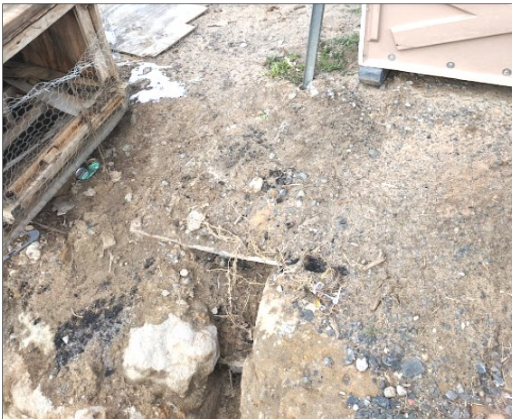
Several areas around the entire Mesa have been identified with small cracks and holes. Please remain alert and cautious when on the Mesa.