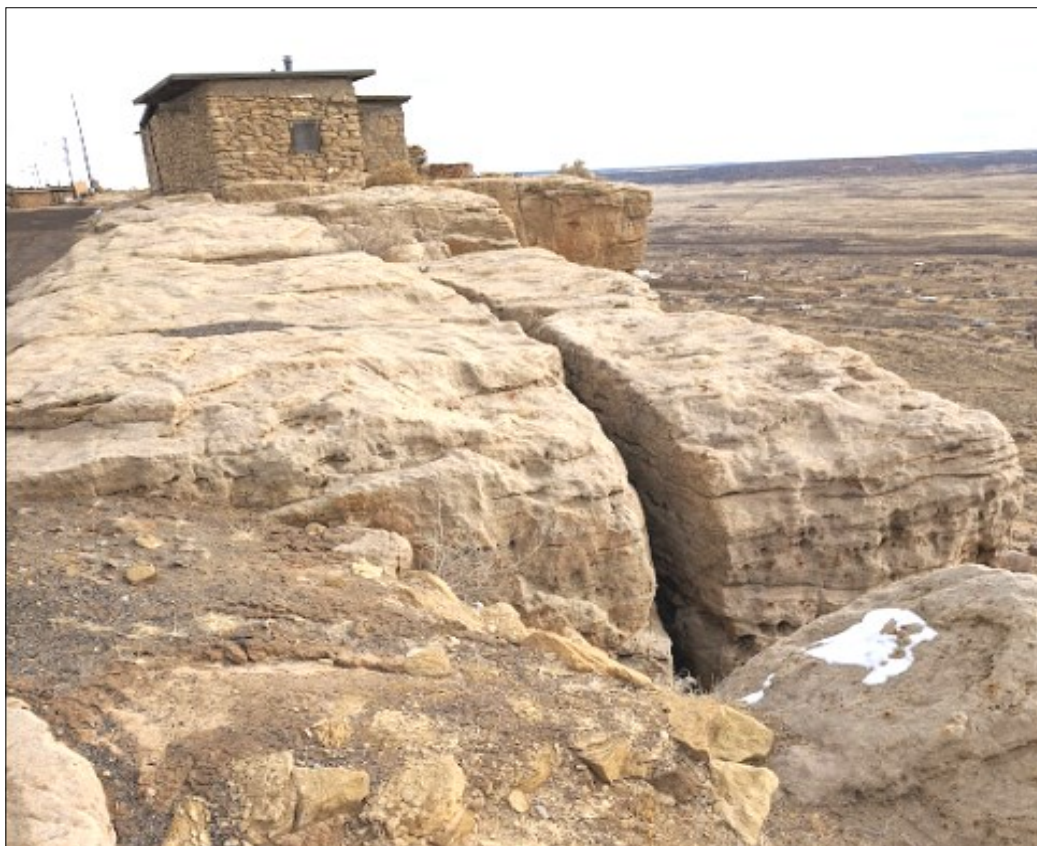
Going into Walpi Village near the dip