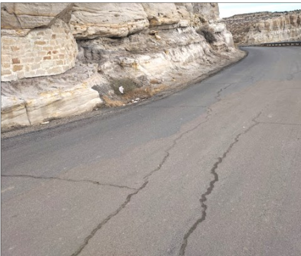
Road leading up to the Mesa. Sealant around retaining wall eroding with several new cracks in the road.