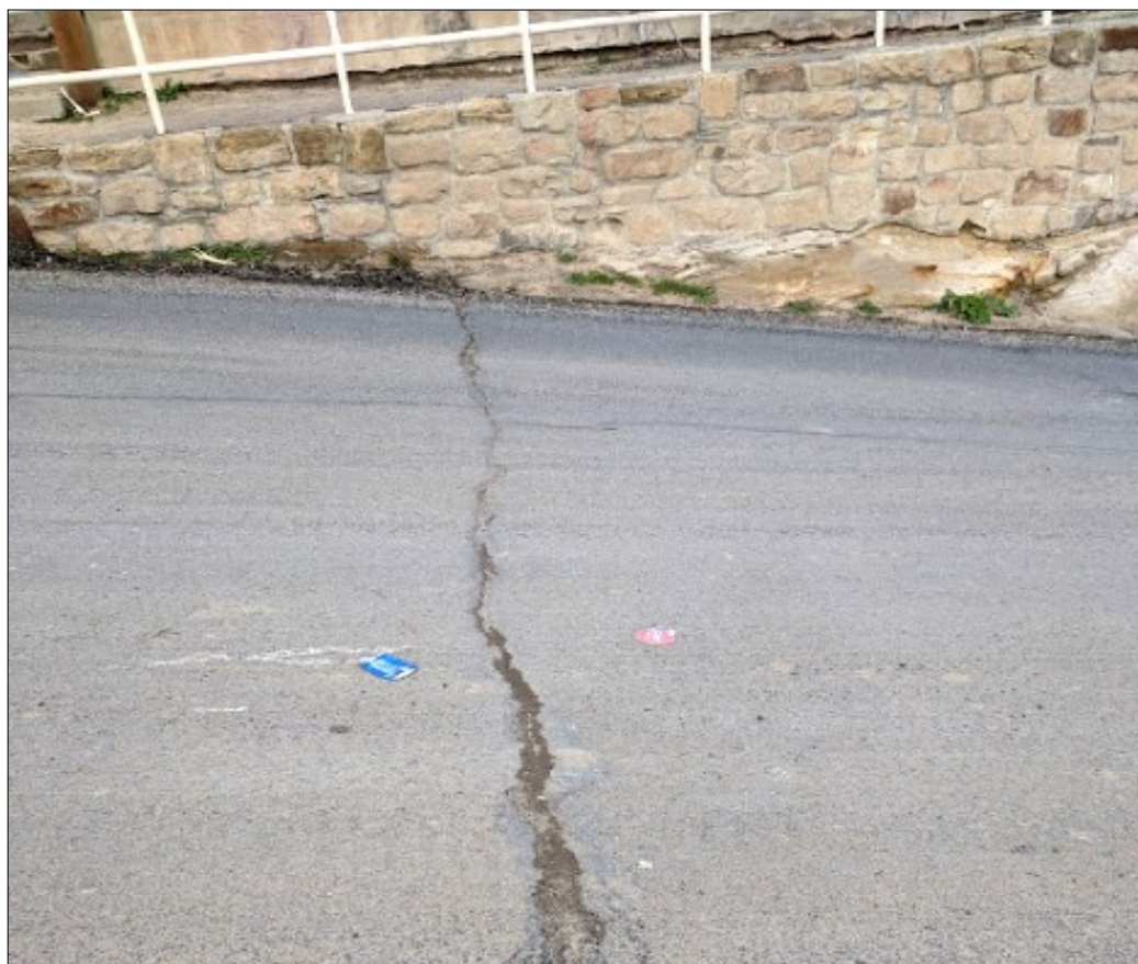
Coming on to the Mesa near the Tewa Road Kiva