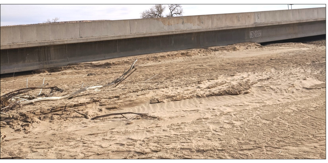
East side— Sediment level filled up to bridge