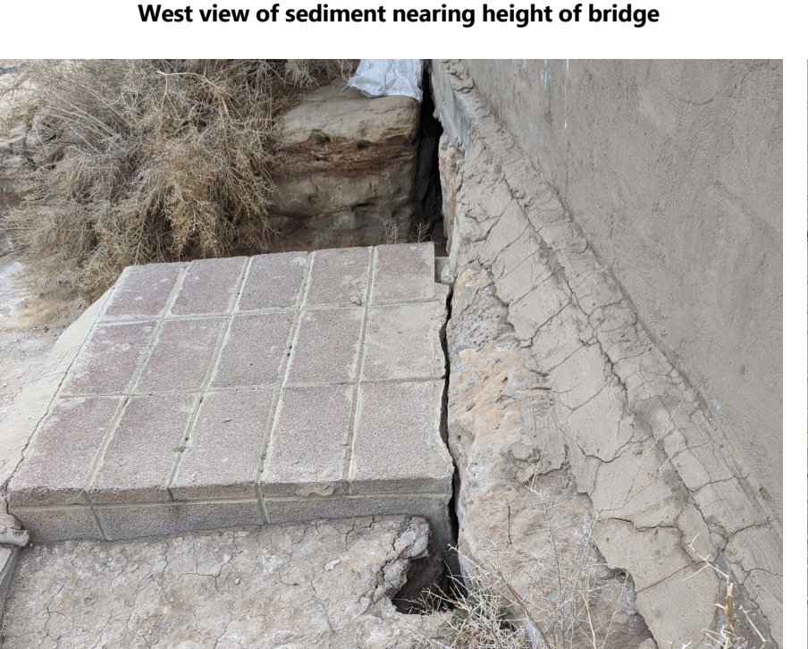
Cracking along incinerator pad