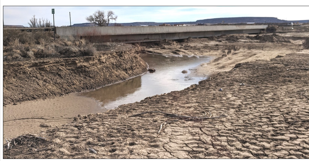
Standing water indicates dense saturation

Unfortunately, the Hopi Tribe DNR stakeholders have not been contacted does not have expert professionals to for "future endeavors." FMCV would provide technical assistance or perlike to pick up where the work left off form the comprehensive studies needfor a complete and comprehensive ed to develop a feasibility plan. This study of the environmental impacts; applies to both the Polacca Wash and short-term and long-term, and mitiga- First Mesa erosion. We are continuing to seek additional resources and are FMCV has sought to identify the ser- confident we will obtain assistance in vices the Hopi Tribe offers, specifically achieving our goals. Please refer to the from the Department of Natural Re- Winslow Levee Project. These tasks are sources (DNR). The departments within comparable in scope, time, and fundhttps://www.winslowaz.gov/