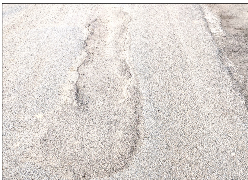
Asphalt fill compressing near Komalestewa's residence