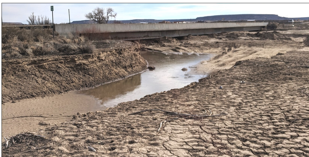
Standing water indicates dense saturation

Unfortunately, the Hopi Tribe DNR does not have expert professionals to provide technical assistance or perform the comprehensive studies needed to develop a feasibility plan. This applies to both the Polacca Wash and First Mesa erosion. We are continuing to seek additional resources and are confident we will obtain assistance in achieving our goals. Please refer to the Winslow Levee Project. These tasks are comparable in scope, time, and funding. https://www.winslowaz.gov/news_detail/T6_R54.php