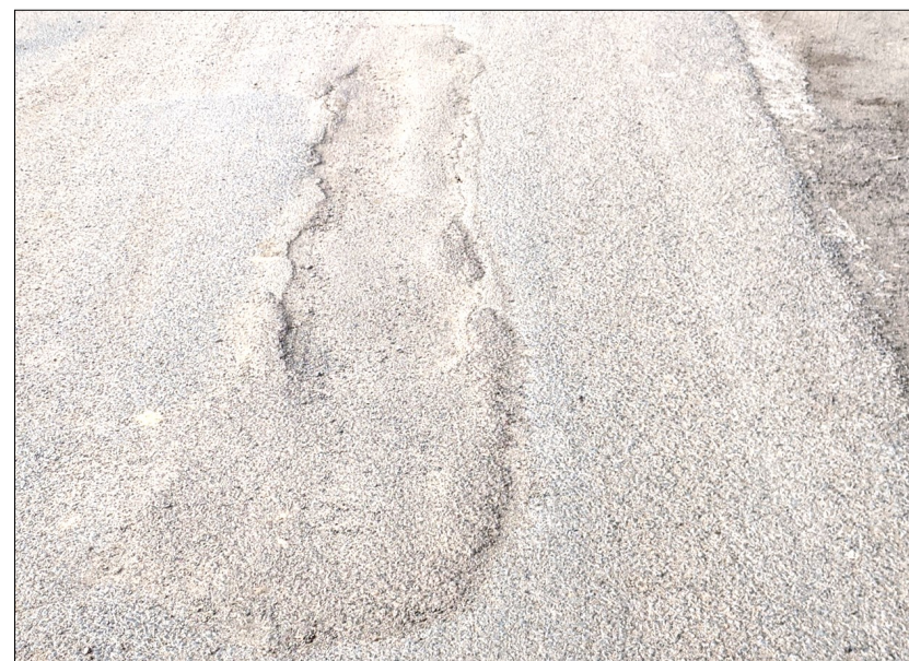
Asphalt fill compressing near Komalestewa's residence