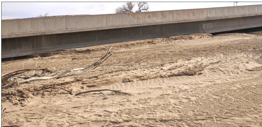
East side— Sediment level filled up to bridge