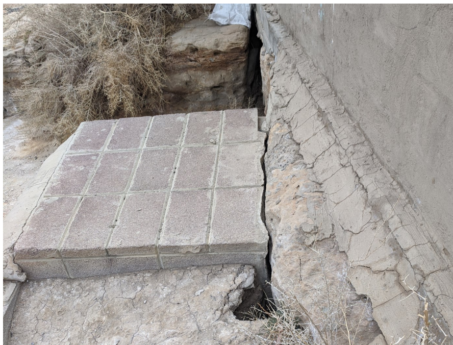
Cracking along incinerator pad