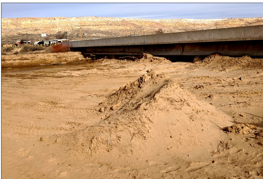
West view of sediment nearing height of bridge