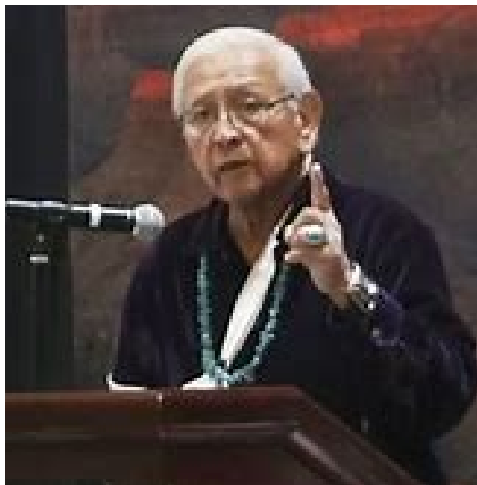
Remembering Peterson Zah, former Chairman and President of Navajo Nation