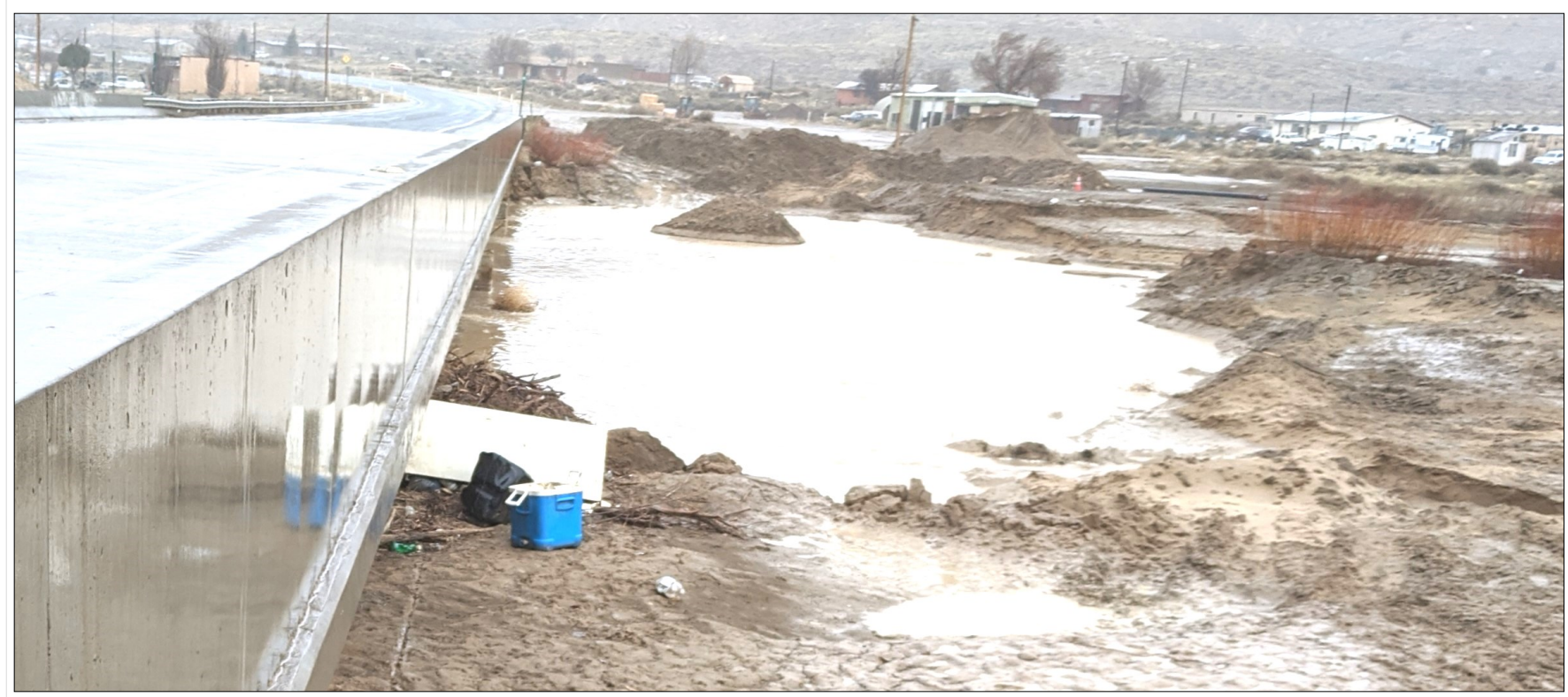
Debris built-up under east Polacca Bridge, after the snow and rains in March

First Mesa Consolidated Villages Office Makes Progress In Flood and Erosion Mitigation Efforts