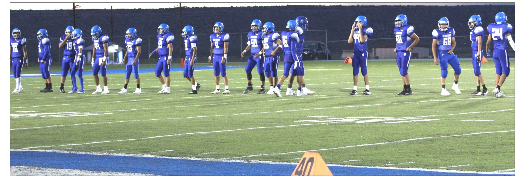
The Hopi Bruins on their home turf as they prepare to face off the Many Farms Lobos in their first Home Game.