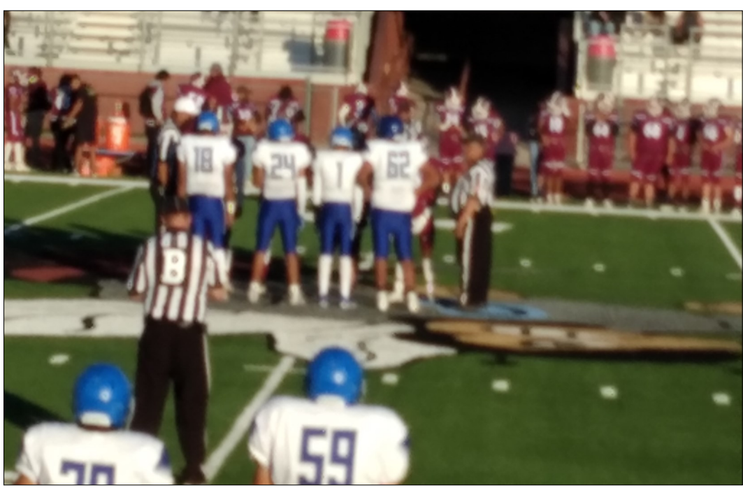
To start off the game, Bruins Line up for instruction from Referees