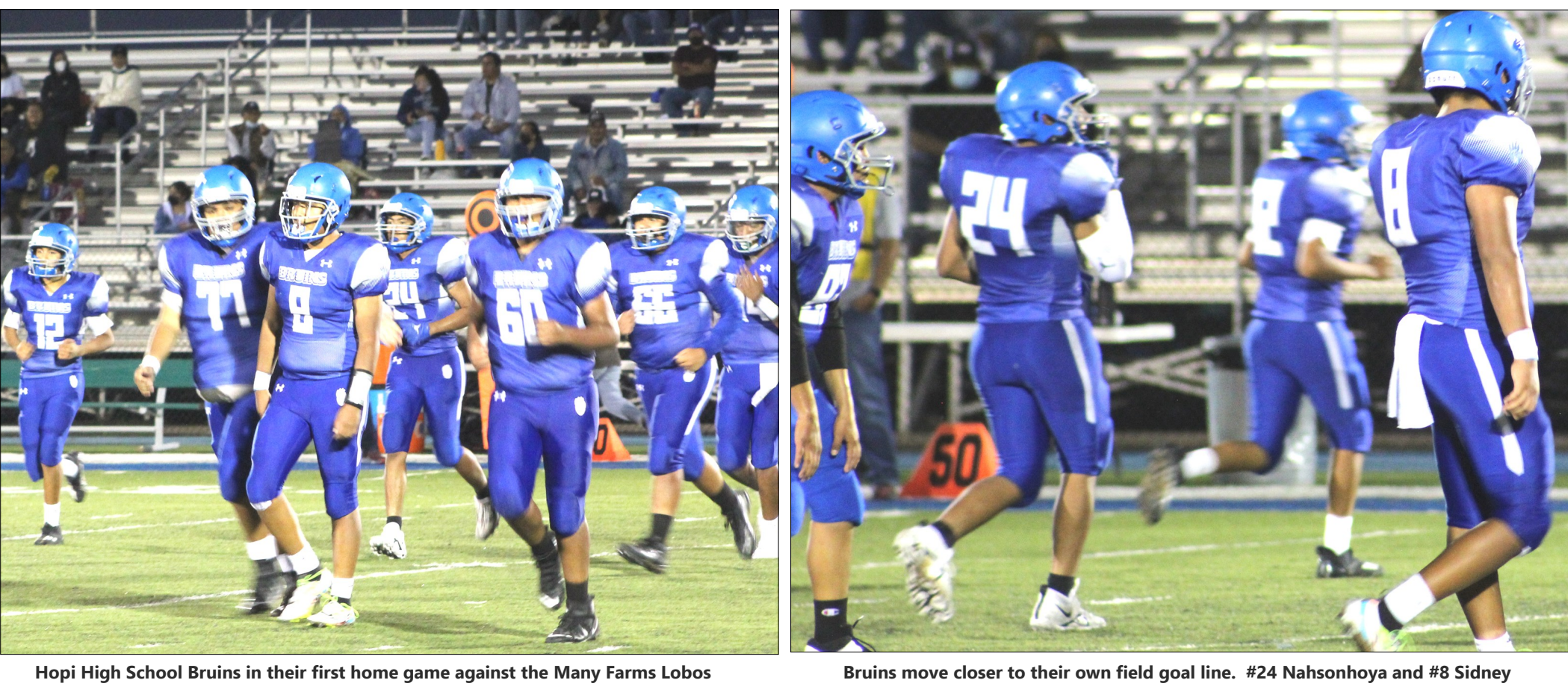
Bruins move closer to their own field goal line. #24 Nahsonhoya and #8 Sidney

Each team broke through once scoring a touchdown apiece. The difference in the game was an early safety by the Ganado defense.