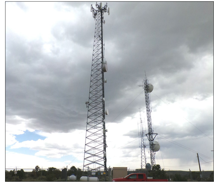
Radio Towers on Antelope Mesa