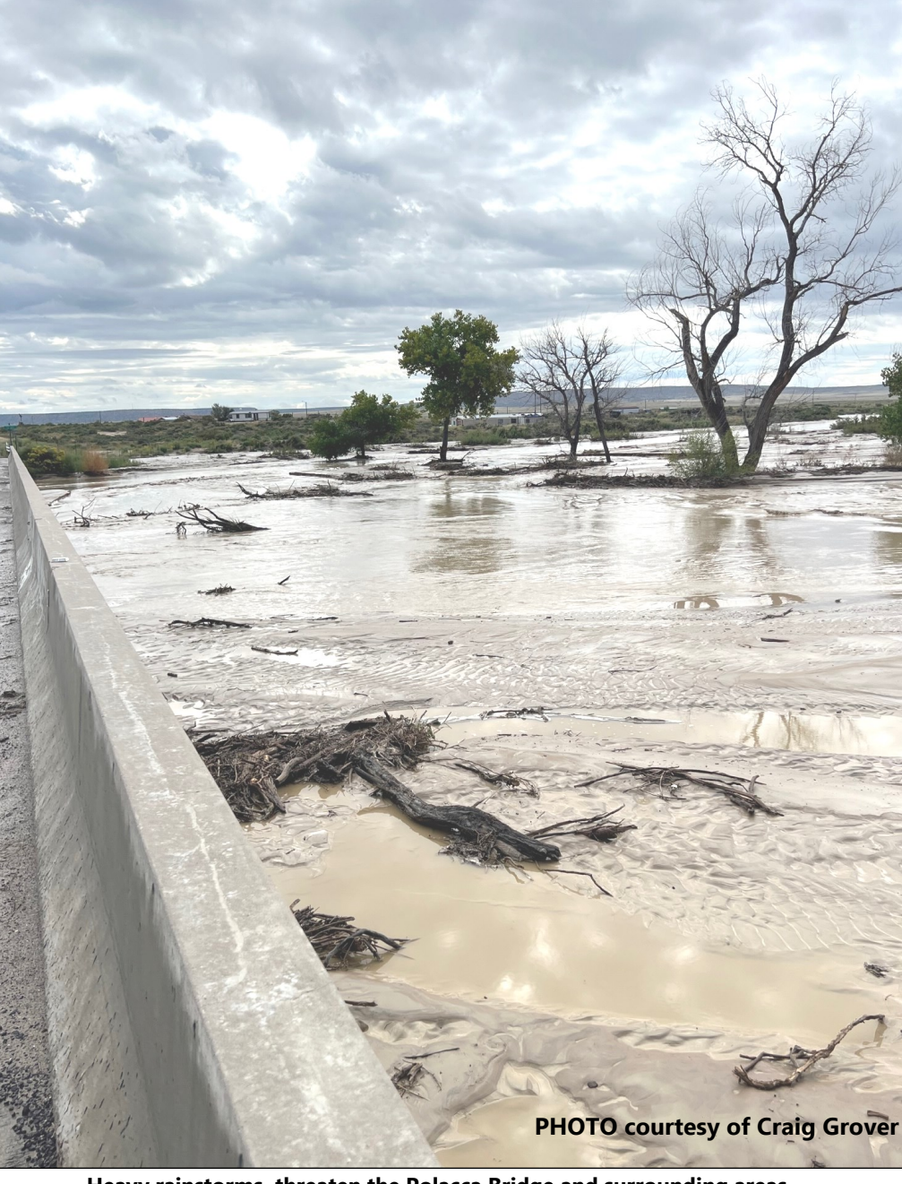
Heavy rainstorms threaten the Polacca Bridge and surrounding areas.