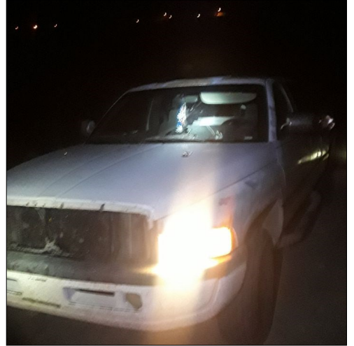
Vehicle Recovered and returned to Owner

FMCV Public Safety Officers, are on foot patrol in the Villages on the Mesa and patrol the areas of Polacca, Keams Canyon and Spider Mound Communities.