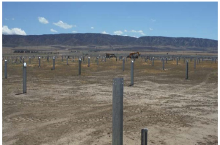
Figure 3 Example of pillar foundations sPower plans to utilize.