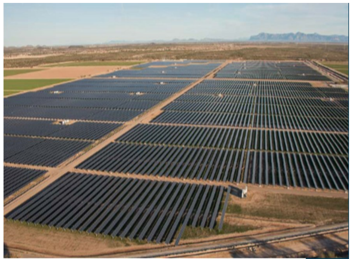
Figure 4 Example of large-scale solar installation for discussion purposes.