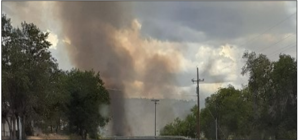
Fire in Keams Canyon