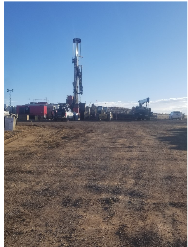
HAMP Well #3 Currently Being Drilled