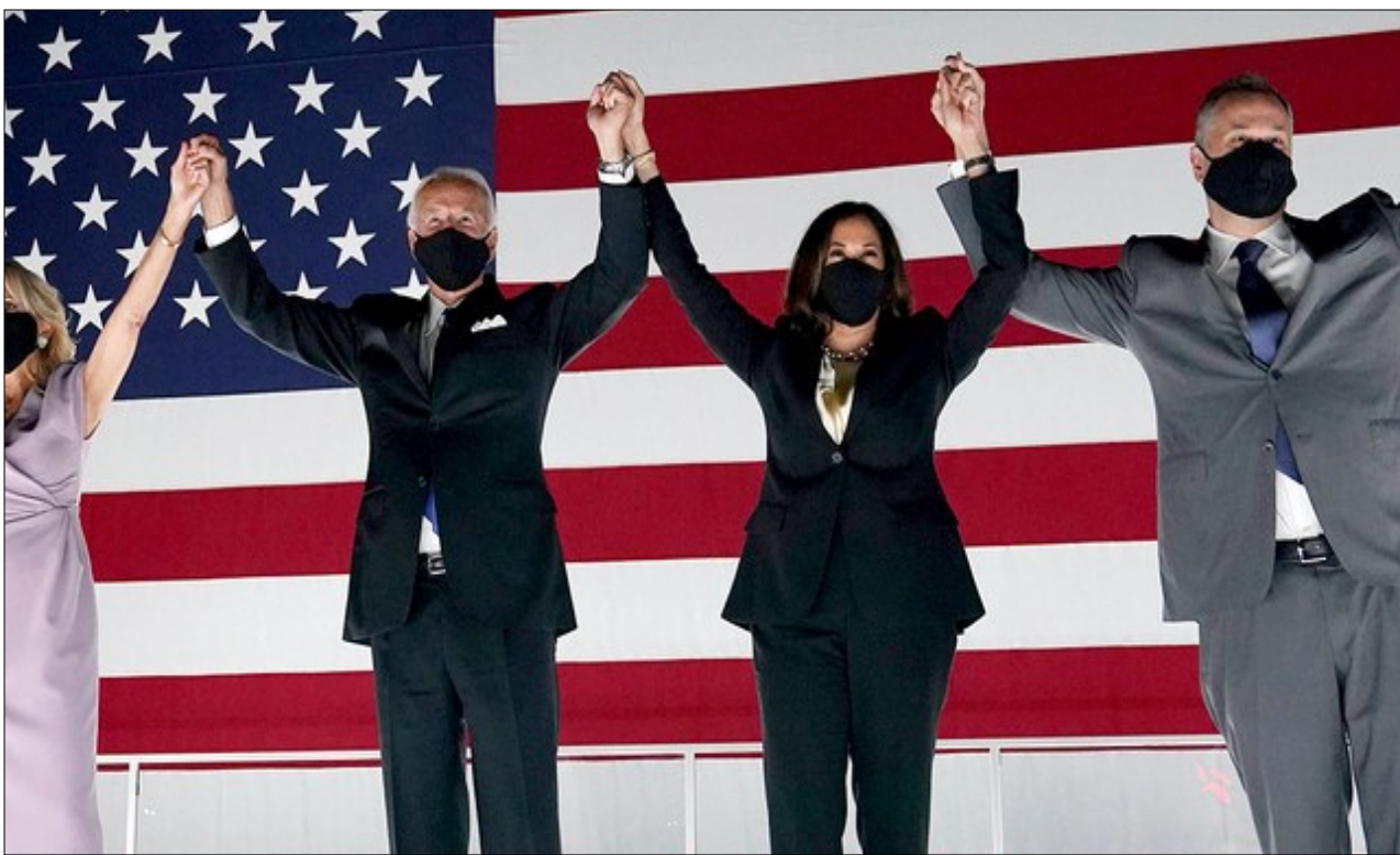
L-R: Jill Biden (incoming First Lady), President-Elect Joe Biden, Vice President-Elect Kamala Harris and husband Doug Emhoff (incoming Second Gentleman)

Former Vice President Joe Biden and U.S. Senator Kamala Harris defeated Republican incumbent President Donald Trump and Vice President Mike Pence in the Presidential election.