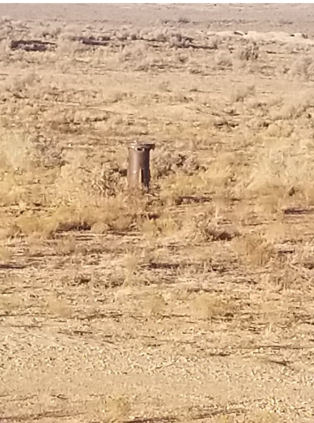
HAMP Well #1