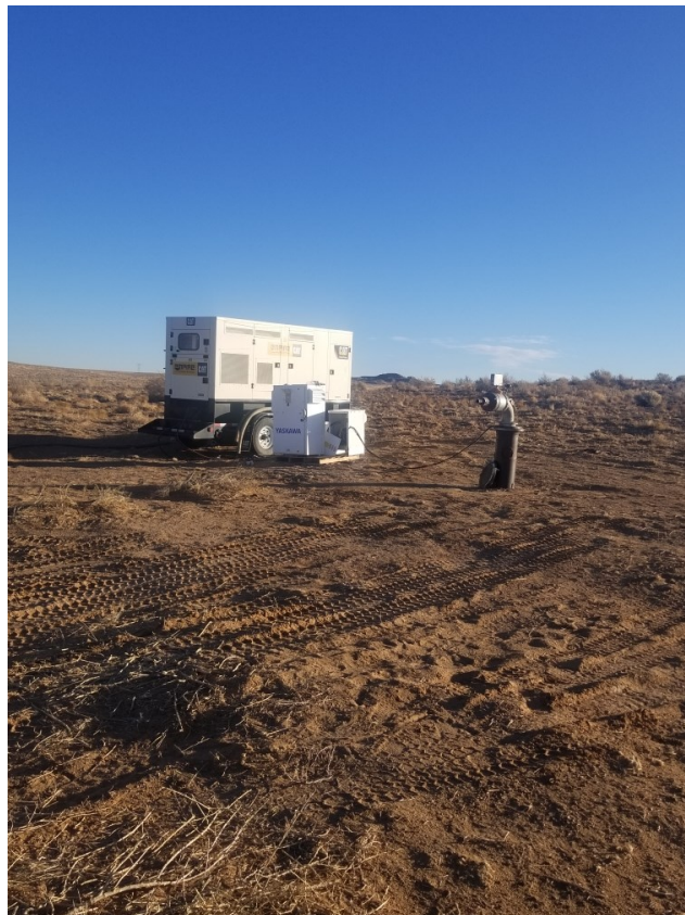
HAMP Well #2