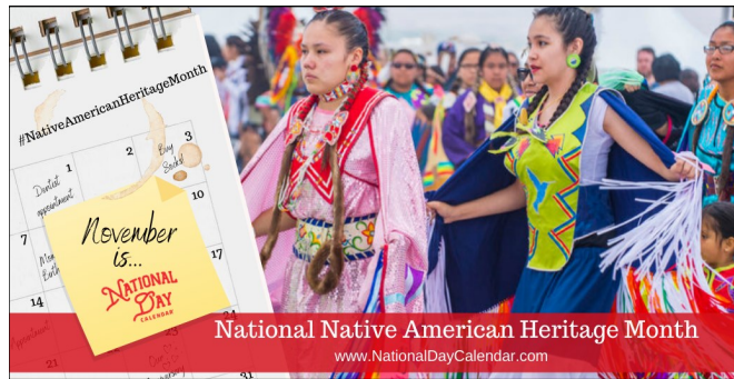
National Native American Heritage Month

This observance is a time to educate everyone about the different tribes, raise awareness about the past struggles native people faced as well as the present. Thousands of years before Christopher Columbus landed his ship in the Bahamas, Native Americans already had cultivated lives and communities. Native American history and culture is rich and diverse and Native Americans have always been known for hard work and quick instinct.