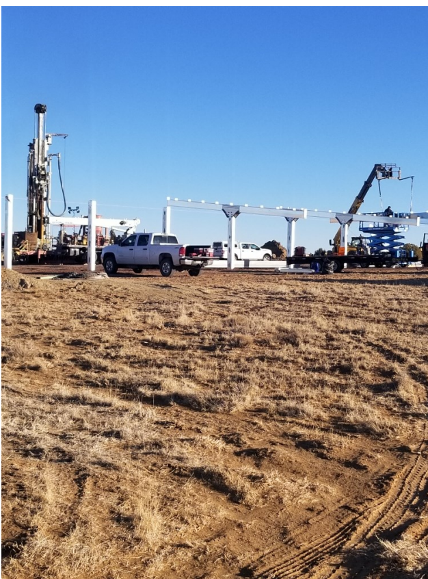
Solar panels currently under construction at Well #3, along with a water tank to bring water to First Mesa