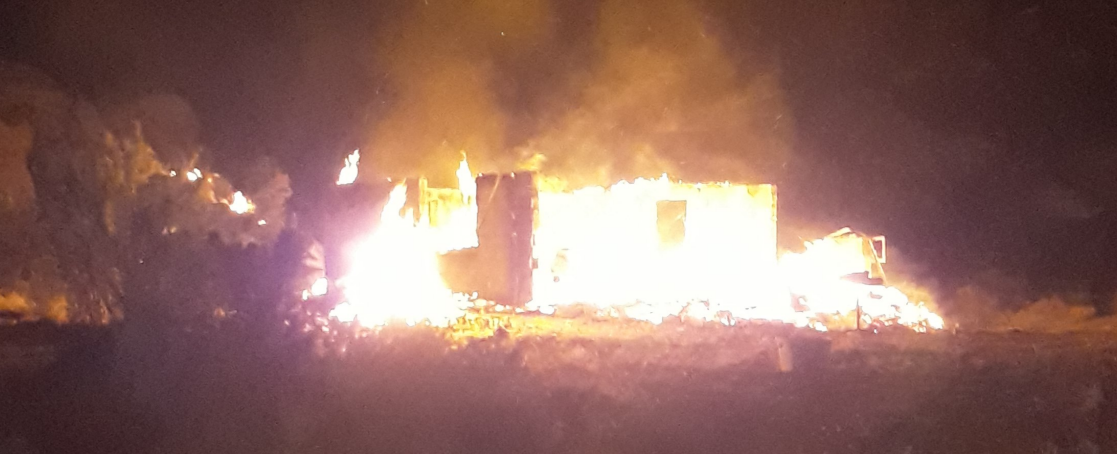
House at Sheep Springs up in flames - totally destroyed by fire

While road closures may have been with good <u>Restricts Visitors, Non-Tribal Members and</u> intent, they also have created problems in Non-Residents into Villages . It does not in-First Mesa, hindering emergency access to clude road closures. situations, such as the fire at a Sheep Camp which destroyed a home; and preventing village residents from returning to their homes on the mesa.