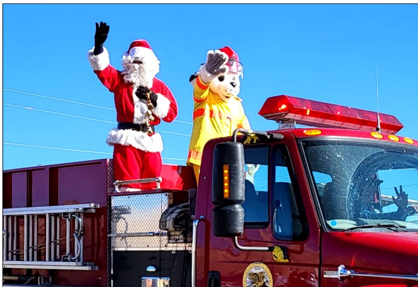
Santa Clause and His Helper

First Mesa Consolidated Villages P.O. Box 260 Polacca, AZ 86042