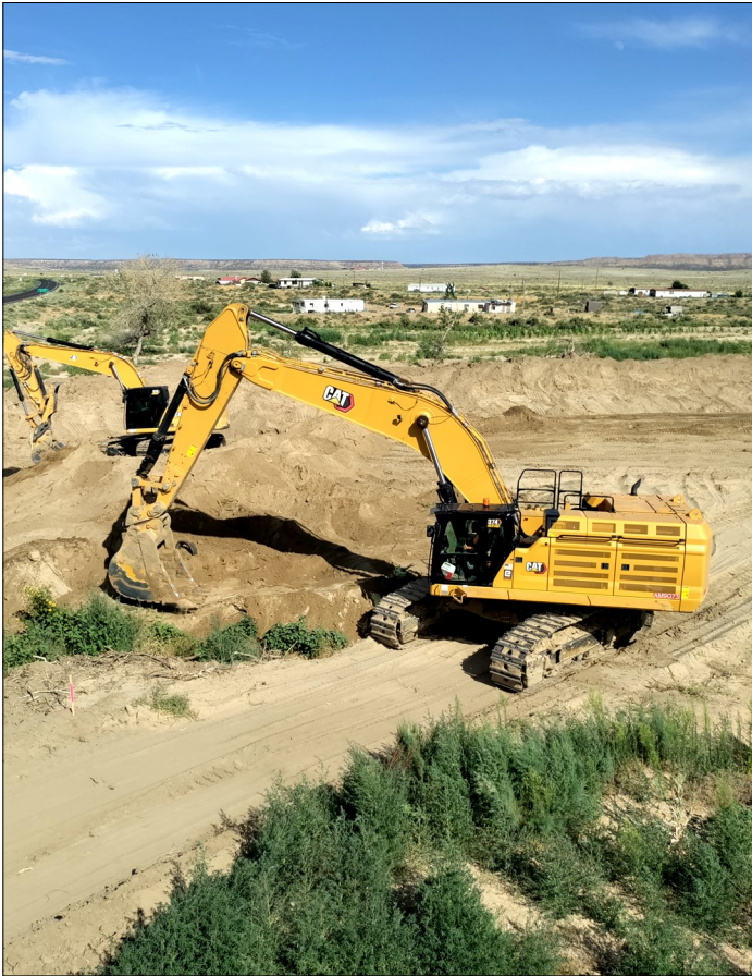
Construction work has begun west of the flooded Polacca Wash Bridge area. Motorists and families in surrounding areas are asked to slow down when driving through the area and be alert when driving around the construction zone.