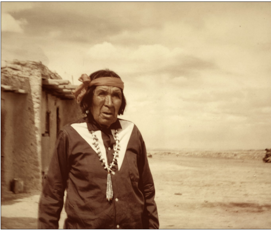
At the Stockholm Olympics, Tewanima won the silver medal in the 10,000m run, setting a US Olympic record that endured for an impressive 50 years until it was broken by Billy Mills, another Native American athlete.

Second Mesa, Arizona – The Louis Tewanima Footrace returns to the Hopi reservation Sept. 3 for its 50th year.