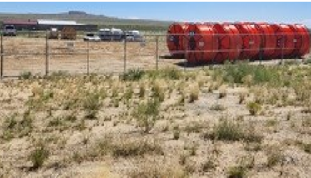
Fiber Optic Cables and equipment stored at First Mesa trailer court yard

pany plans to establish full services for propane at its business site and provide local immediate delivery. The company has