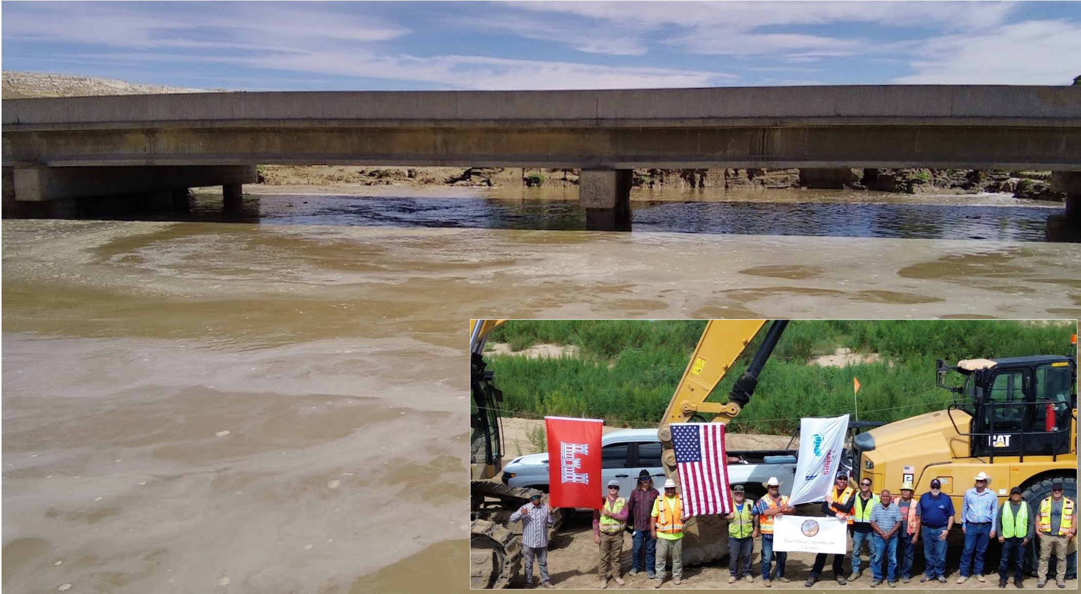
Upon completion of the temporary flood control mitigation efforts at the Polacca wash, rains hit the area and the temporary channels kept the water flowing downstream and deterred flood overflow. The channel was dug from the Polacca Bridge for approximately one quarter mile downstream. PHOTO ABOVE: Despite the heavy rainfall, water is now flowing under Polacca bridge. INSET: The Army Corps of Engineers and labor crew along with FMCV Administrator Ivan Sidney, FMCV Consultant Myron Ami and Staff Assistant Wilber Kaye celebrate flood control mitigation efforts.