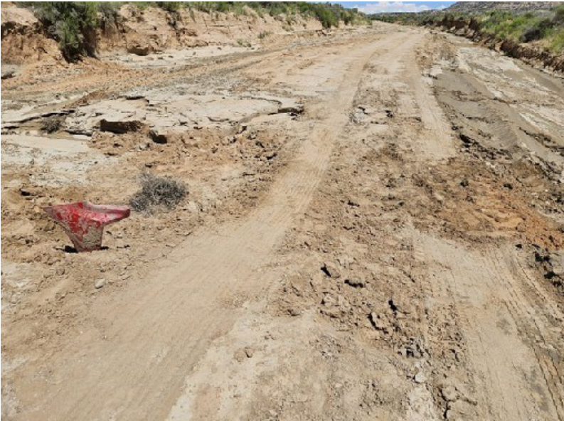
Unpassable road conditions at Low Mountain Road

Our office also received a request from the Hopi Jr./Sr. High School Transportation Department to repair road damages on BIA Route 60. Some of these roads should have priority for immediate repairs after foul weather conditions. FMCV was able to provide some assistance to homeowners without cost.